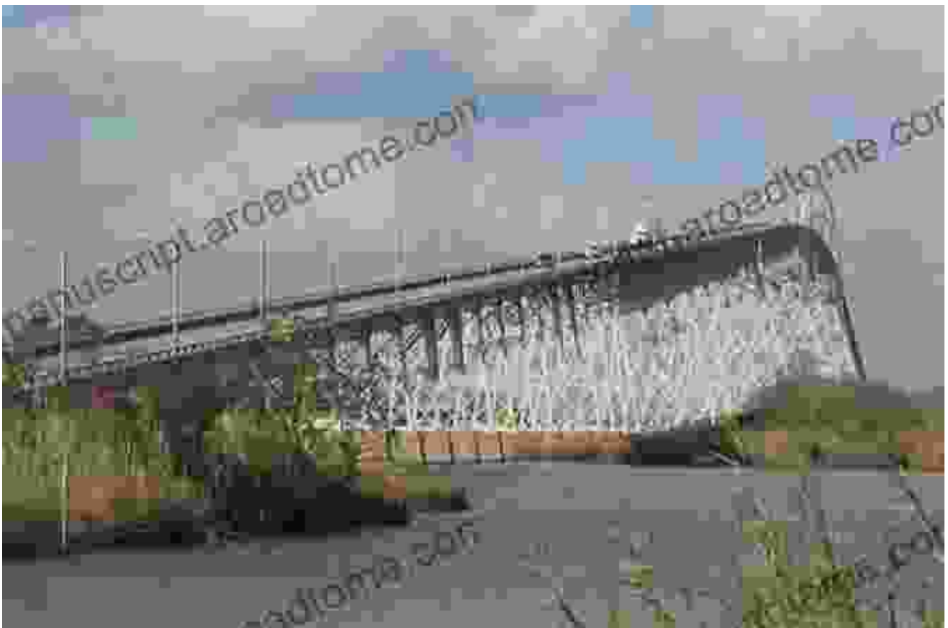
Social Programs: Addressing Human Needs

In Orange County, these projects played a crucial role in modernizing the county and providing essential services to its growing population. New schools, such as Fountain Valley High School and Huntington Beach High School, were built to accommodate the influx of students. The Anaheim General Hospital, which later became the UCI Medical Center, was established as a vital healthcare facility for the region.