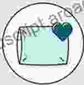
Bedside care and assistance