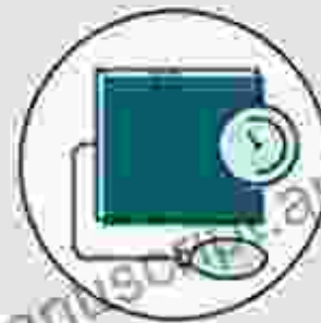
Monitoring of vitals and recovery progress