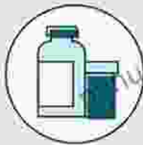
Administration of medication