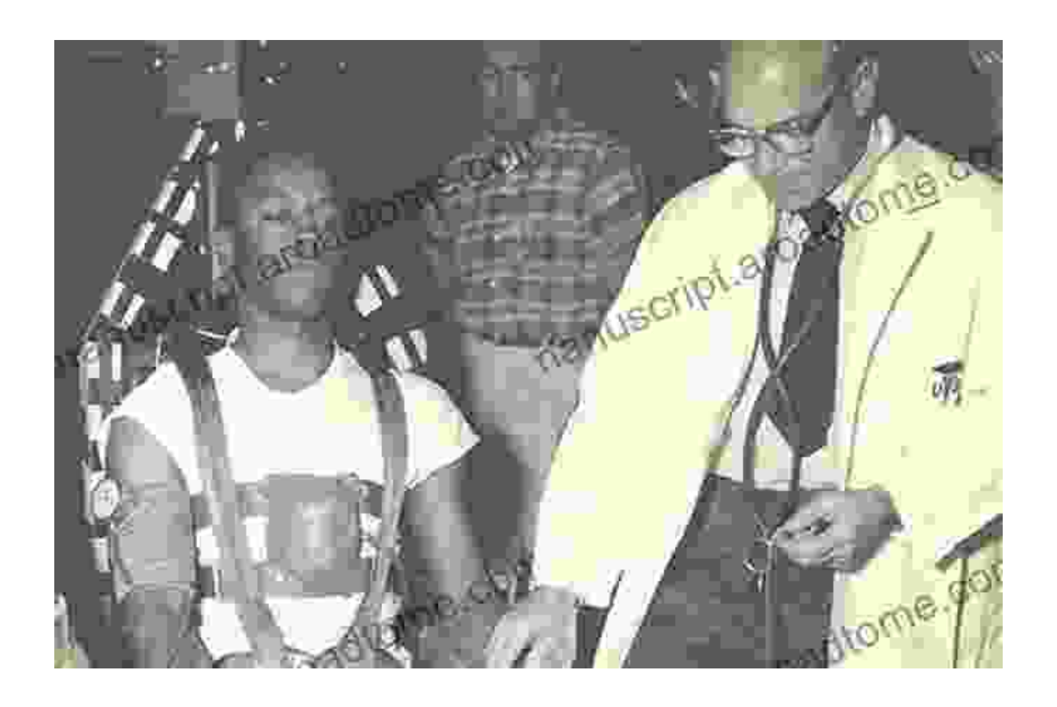
Alton Yates, civil rights activist

Yates' remarkable story is a testament to the transformative power of human perseverance. His achievements in aerospace and his unwavering dedication to social justice serve as an enduring legacy, inspiring generations to overcome adversity and strive for a more just and equitable society.